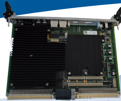
Octal Tiger Sharc Board